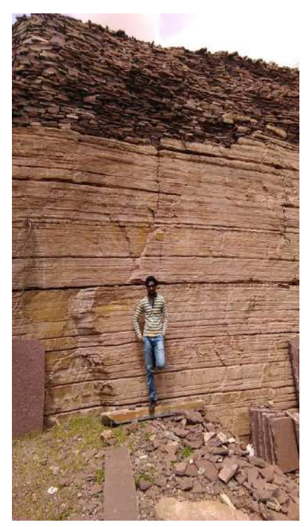
Conglomerate & Quartzite at Bagalkot